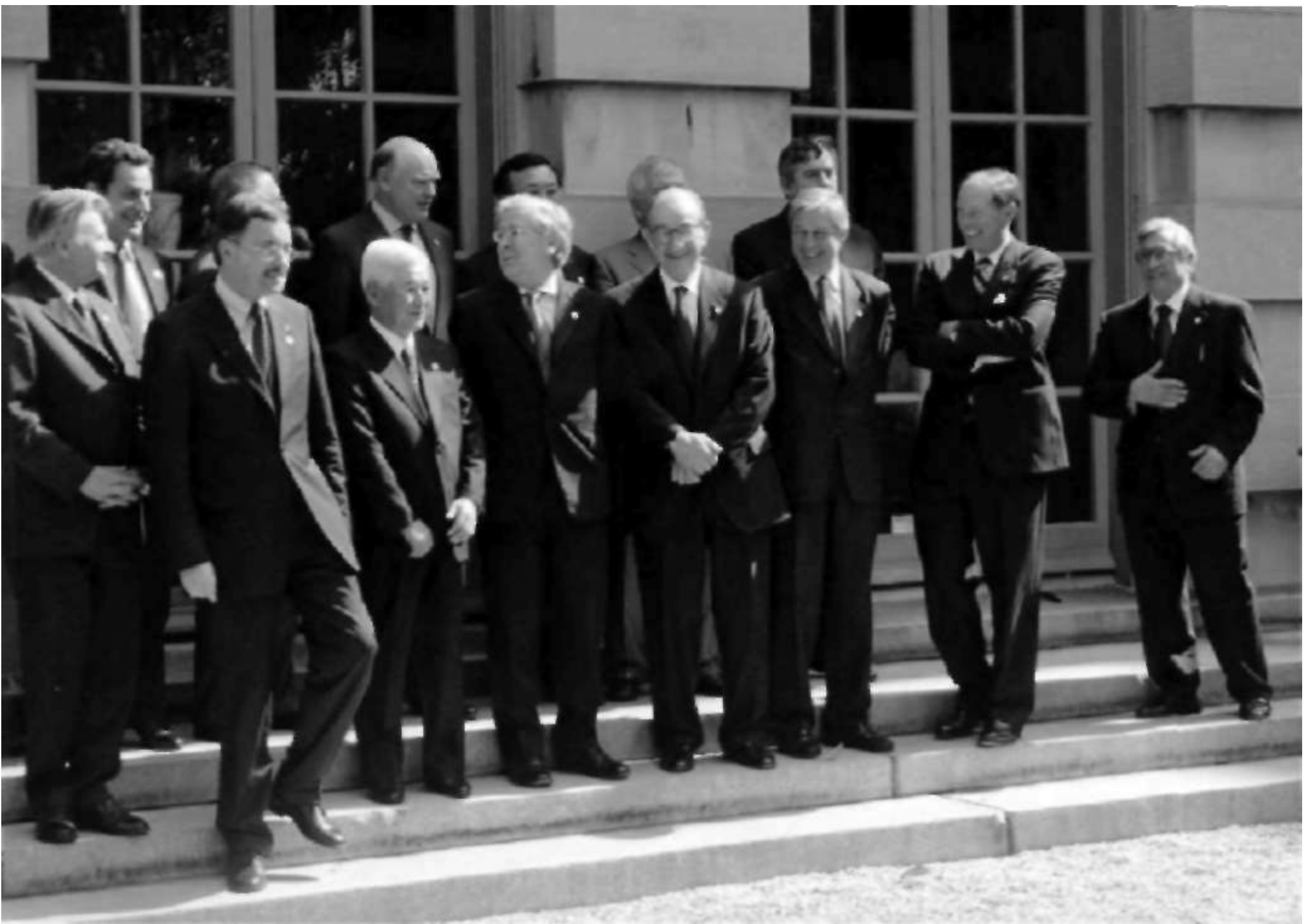
The world's top finance ministers ( back row) and central bankers ( front row) gathered in Washington, D.C., for a G7 meeting of economic policymakers. Among the finance ministers are France's now-president Nicolas Sarkozy ( second from left) and Great Britain's now-prime minister Gordon Brown ( back row, far right).