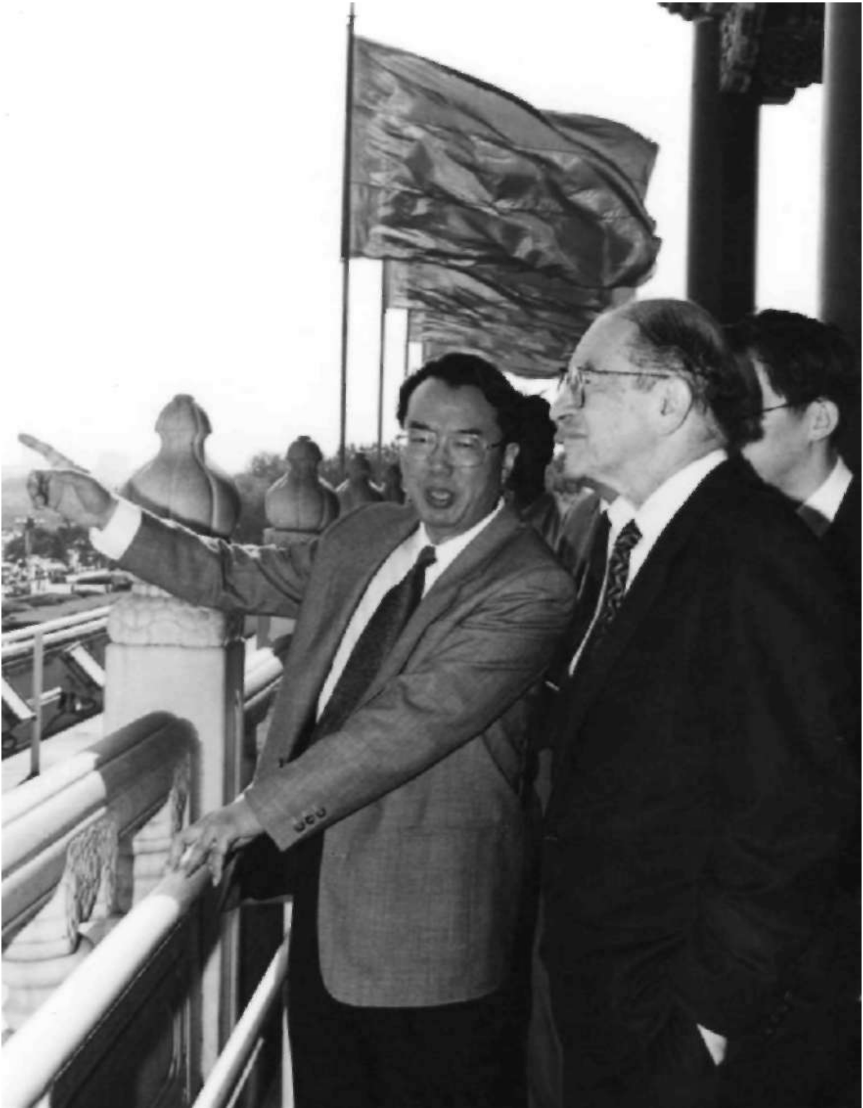
Looking in Tiananmen Square from a balcony near the spot where Mao declared the creation of the People's Republic of China.