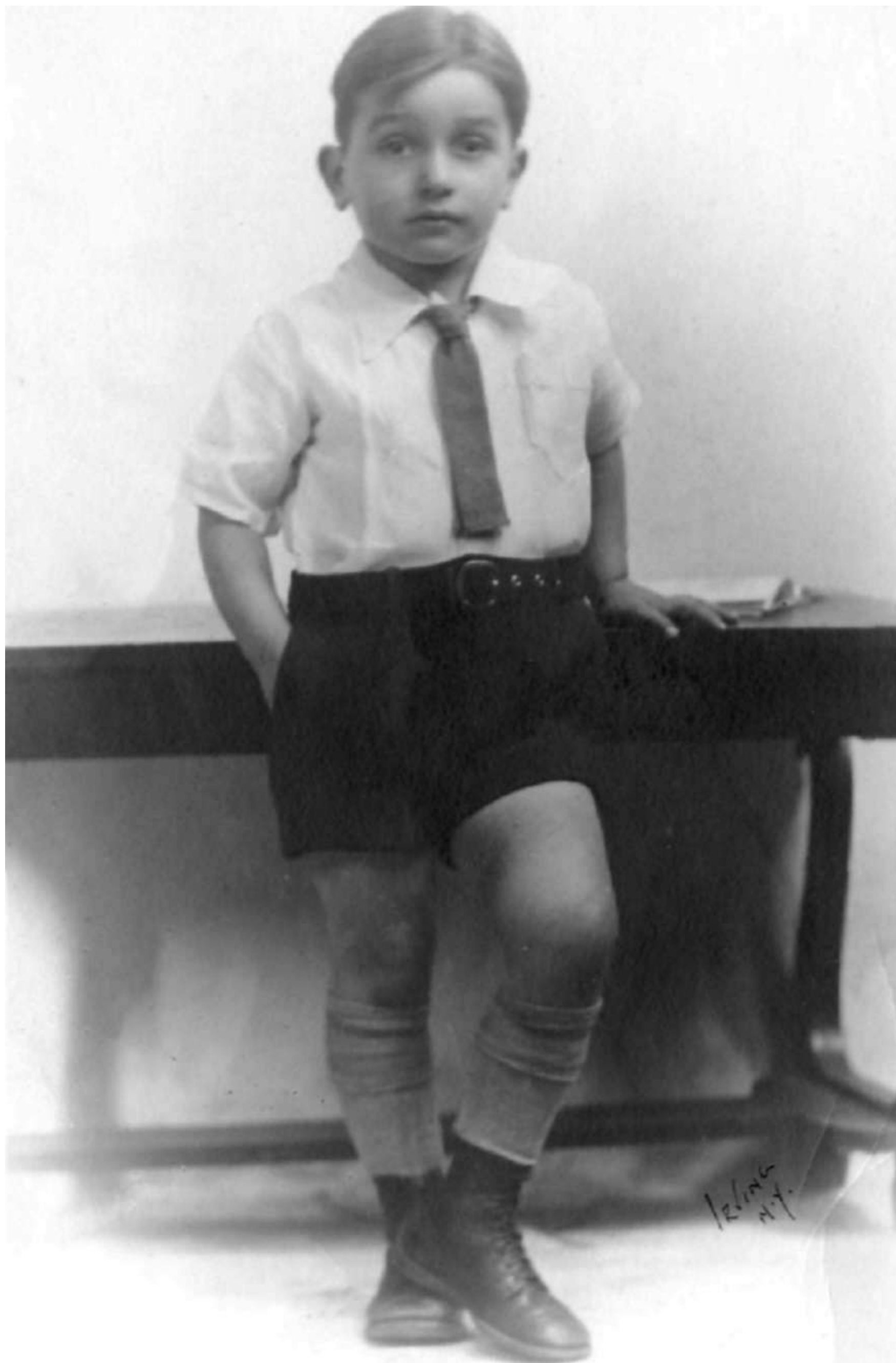
Age five, Washington Heights, New York City, 1931.