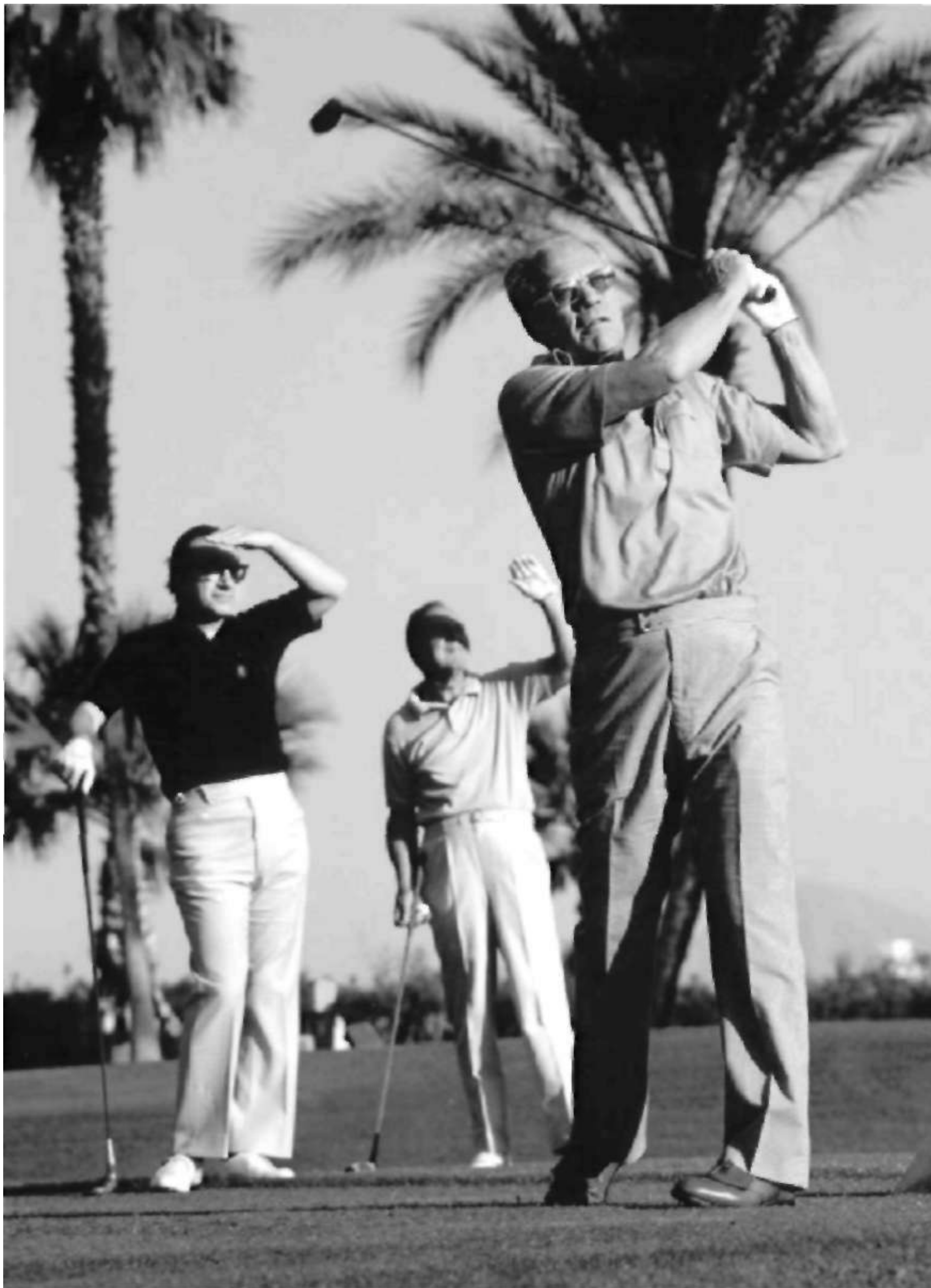
With President Ford in Palm Springs, 1980. Contrary to his reputation for being physically clumsy, he was a formidable golfer and a former All-American football player.