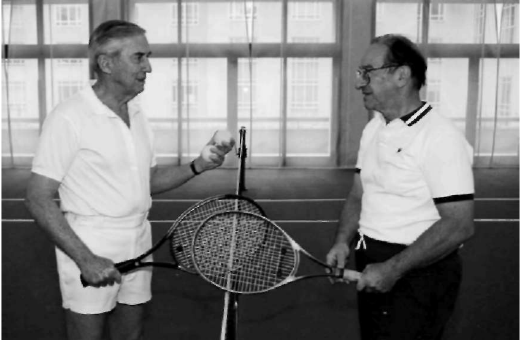
Across the net from Treasury Secretary Lloyd Bentsen at the Senate tennis court, 1994. Lloyd, a good friend, played an underappreciated role in launching Clinton's successful economic policies.

As America's economy became more and more integrated with the world's during my tenure as Fed chairman, I became increasingly involved in aid for other countries in economic crisis. Magazine cover hyperbole aside, Treasury Secretary Robert Rubin, Deputy Treasury Secretary Lawrence Summers, and I had an unusually fruitful and harmonious working relationship; I greatly respect them both.