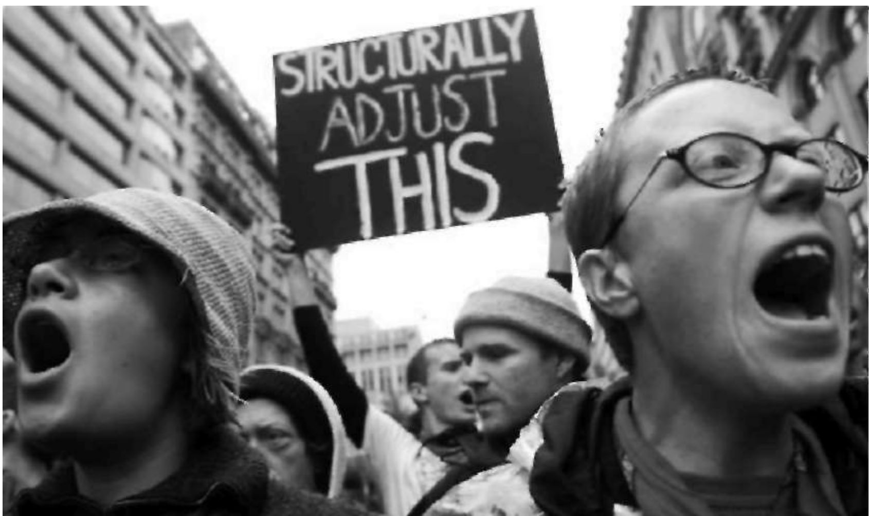
A band of protesters hoped to disrupt the World Bank/IMF annual meeting in Washington on April 17, 2000. Ironically, the intensity of such public protests has increased almost in lockstep with the diminution of the power of nation-states, separately or in coordination, to bend global market forces to their will.